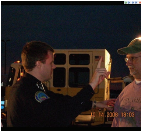
Two Marshall Police Department employees demonstrate testing used for alcohol violations.

We believe that an informed citizenry will make better decisions about their community; enhance public safety, by making better decisions about how to protect themselves, their property, and their community; understand policing strategies and provide leadership to other areas of the community and government.